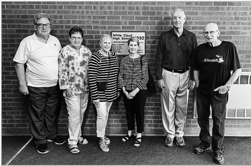
Members of the White Cloud Class of 1962 take a tour of the school as they celebrate their 60th class reunion recently.